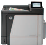
HP Color LaserJet Enterprise M651dn