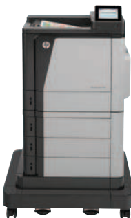
HP Color LaserJet Enterprise M651xh